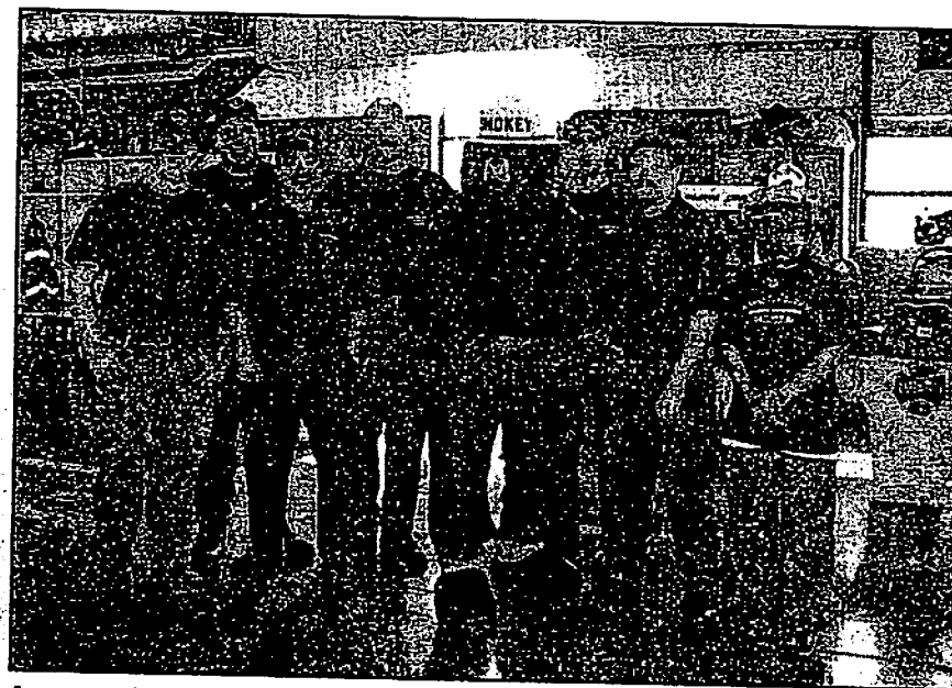
A group of local and visiting firefighters pose with everyone's favorite, Smokey the Bear. A friend Sparky from Plymouth, joins in.